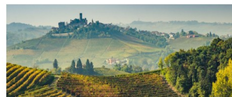
Bellavita - Sweet Red Gattinara, Italy

Color: Red Palate: Fruity, lightly sweet and elegant. slightly sparkling Food pairings: APERITIVE , PASTA , PIZZA AND ALL ITALIAN DISHES